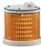
TWS F SMD TWSFSMD