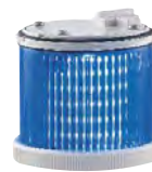
TWS MULTI SMD TWSMULTISMD