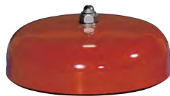
CEAD 165 R CEADEL 165 R CD165R CDL165R