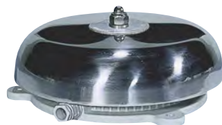
SIAD 215 NAVE STSD215N