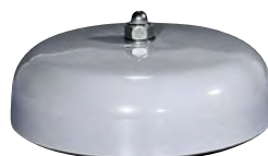
CEAD 165 G CEADEL 165 G CD165G CDL165G